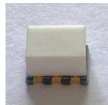
2 Way-0° 50Ω 3 to 750 MHz